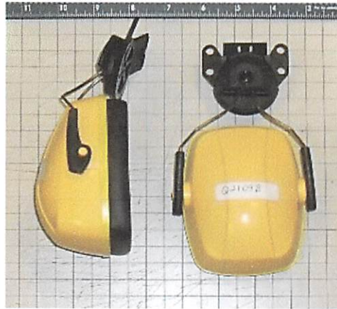
Test Item: Q2109A

These data were obtained through measurements made at the laboratories of Michael & Associates, Inc., State College, PA , USA. Michael & Associates, Inc., is accredited to test to ANSI S3.19-1974, ANSI S12.6-2008 and AS/NZS 1270:2002 by the National Institute of Standards and Technology (NIST) National Voluntary Laboratory Accreditation Program (NVLAP).